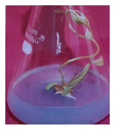
Fig 4: Complete regenerate plantlet via somatic embryo showing well developed roots on \frac{1}{2} MS + activated charcoal (0.5%).