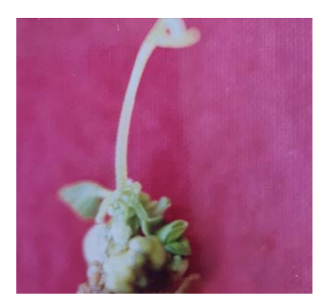
Fig 3: Germinated Somatic embryo with shoot differentiation.