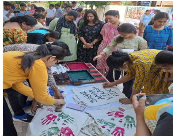
Under Processing skill development activity