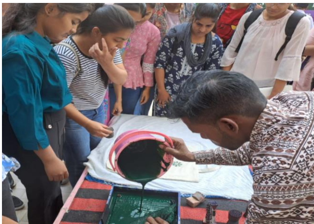
Hands on Activates done By Expertise