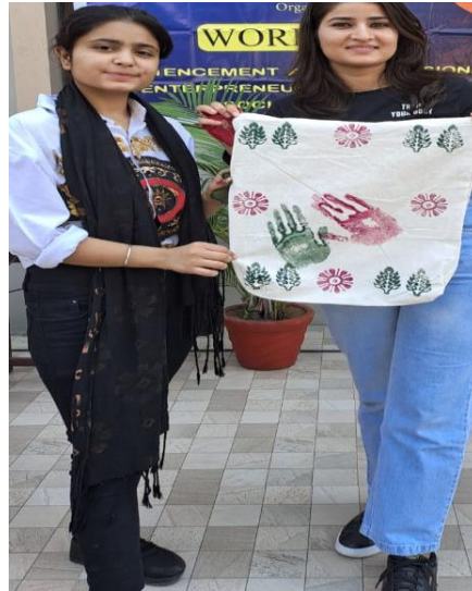
Experimental work done by students