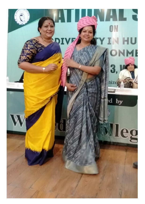
Felicitation of Guests