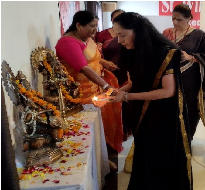
Seminar Inaugural with lamp lighting by Chief Guest