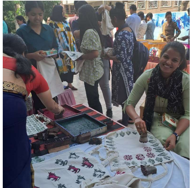
Participation by Students