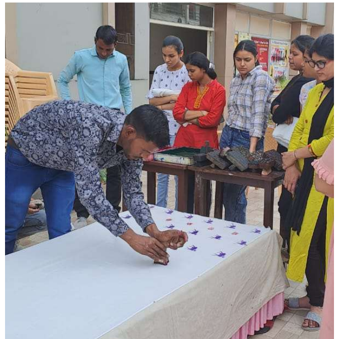
Demonstration by Experts